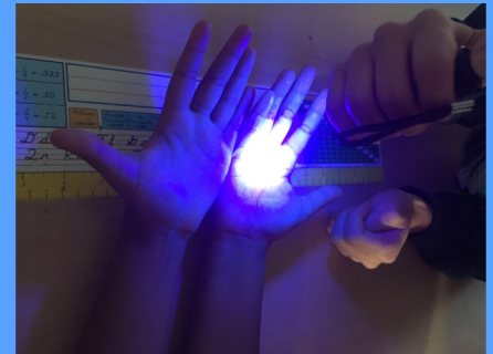
Glo- Germ Kit