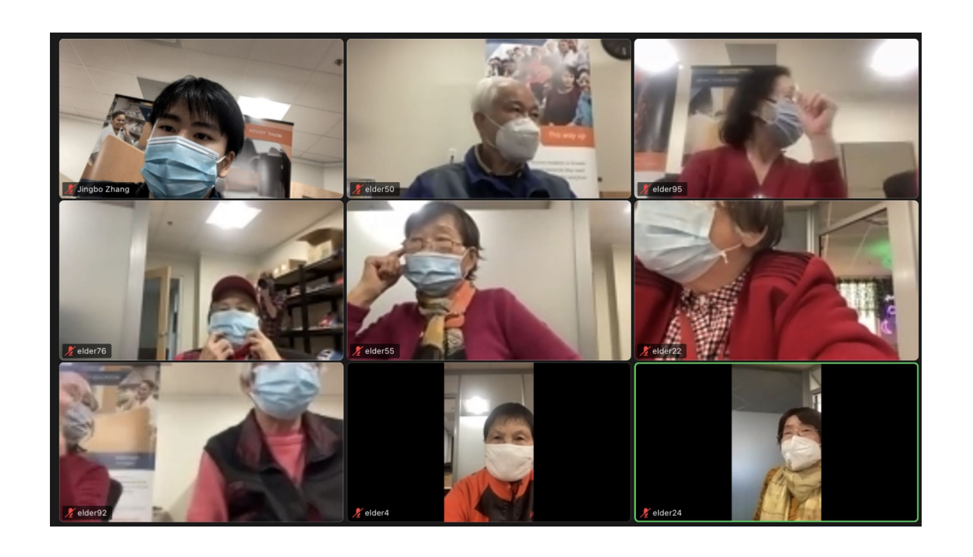
ABCD Foster Grandparent Program