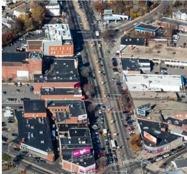
Blue Hill Avenue