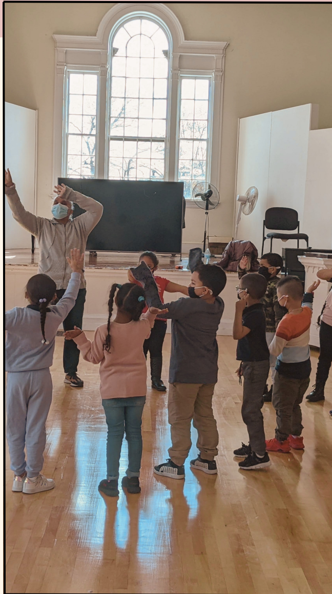
An instructor leads a class in creative movements in an after school program