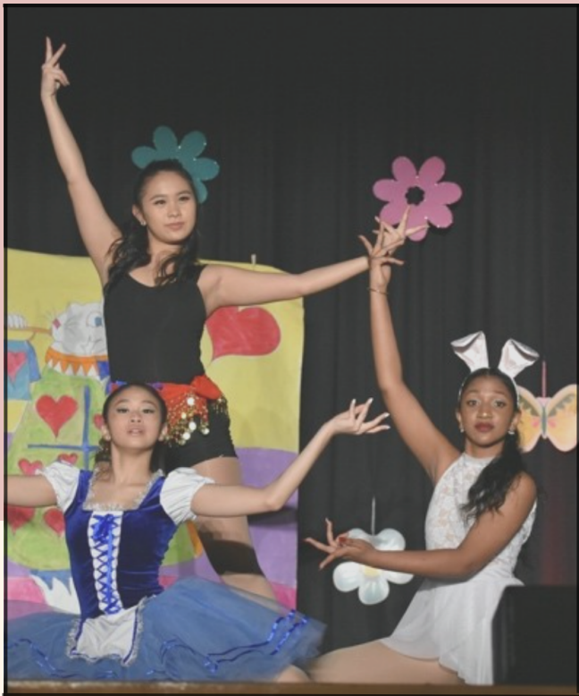
Dancers pose during BalletRox's spring recital from 2021