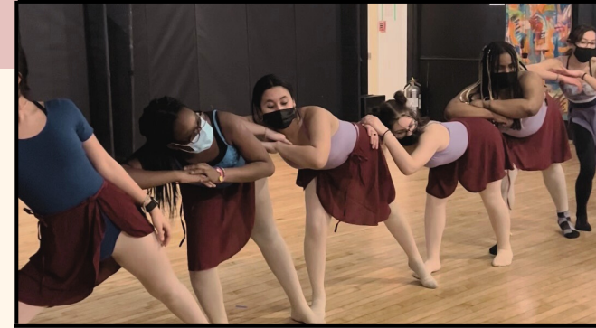
Dancers pose during their piece performed in the Winter Fundraiser Recital "Light of Hope Through Dance"